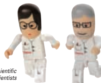
Thermo Scientific USB scientists